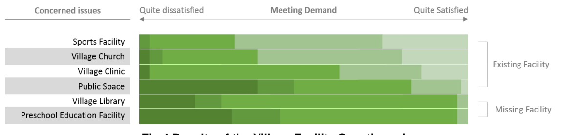
Fig.4 Results of the Village Facility Questionnaire

Public facilities in the study site are ill equipped (see Fig.4). More amicable public spaces are necessary. Basic education and sanitation facilities are also urgent requirements for current and future generations. User-oriented design at community scale demands building strategies that takes into account close-to-people hardware facilities. Software enhancements can be well engaged with well-considered community construction, leading a more vigorous village life.