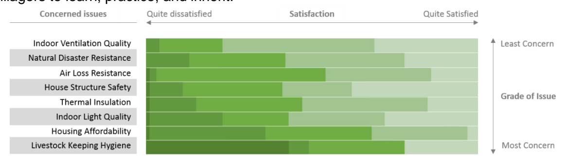
Fig.3 Results of the Vernacular House Performance Questionnaire

appreciated by local people. Therefore, an effective method is to perform sustainable renovation work on these houses using advanced but low-cost techniques, instead of opting to demolish or abandon the old houses. The renovation techniques should also be easy for villagers to learn, practice, and inherit.