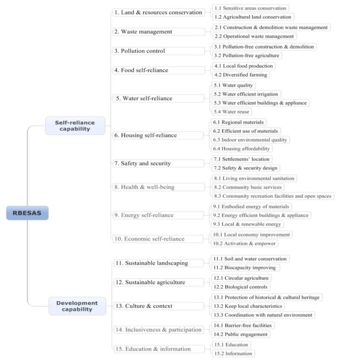
Fig.1 Framework of RBESAS issues and indicators (Wan 2013, p.116)

The framework on issues and indicators of RBESAS is shown in Fig.1.